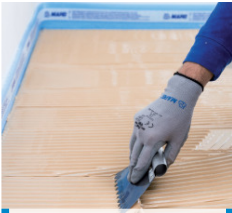
Easy to trowel