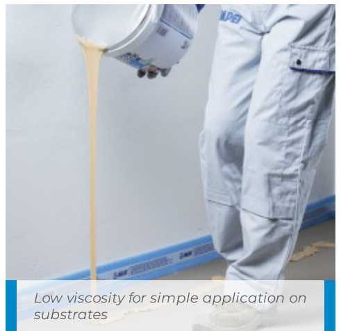
Low viscosity for simple application on substrates