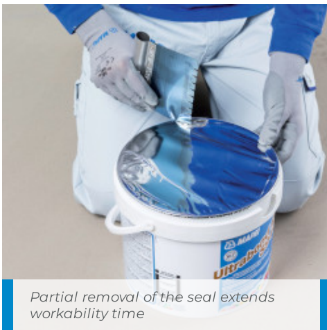
Partial removal of the seal extends workability time

When laying, press down firmly to make sure the adhesive is well applied to all the wood. The special rheological properties of Ultrabond Eco S948 1K makes final adjustment easy. Leave a joint approximately 1 cm wide around the perimeter of the floor and around columns and other protruding points. Make sure that adhesive does not seep through the joints to avoid dirtying the surface.