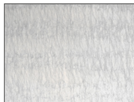
HIGH COVERAGE = 20 dry gms/sq